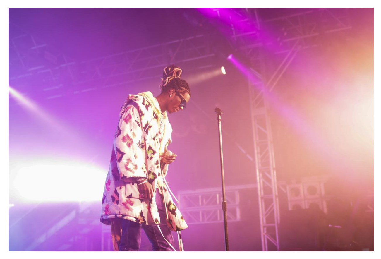
Young Thug

Face value for a general admission ticket was $650, and that got you cocktails, as well as passed crab cakes, meatballs, spanakopita, other finger foods, and the opportunity to gawk skyward at the VIPs leaning over the upstairs balcony. (This reporter wasn't allowed to go up there, so I have no idea whether they got bigger crab cakes for their $900 tickets. Or $10,000 tickets, if they reserved a table.)