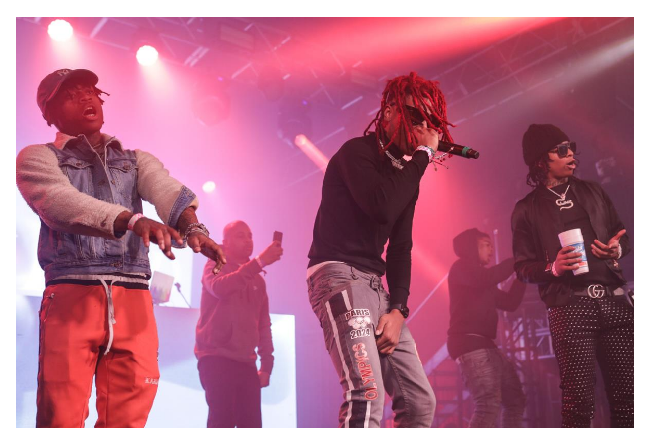
Lil Keed